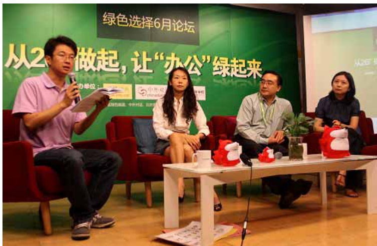
Delegates of Shell, HP and Beijing Fuping Development Institute conversing on Green Office

The forum called for enterprises' joint efforts, based on the questionnaire research discovery on Green Office conducted by specialized institution, combined with relevant experience from Shell and HP as well as those of Fuping's when Fuping practicing Green Office in several businesses.